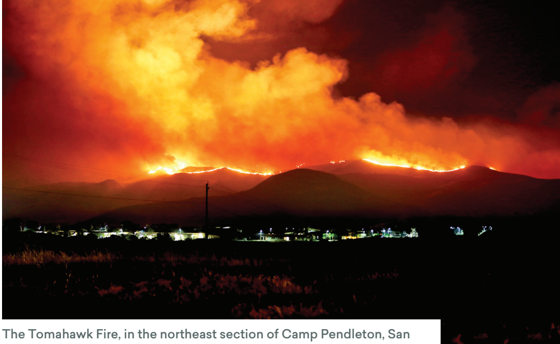
The Tomahawk Fire, in the northeast section of Camp Pendleton, San Diego County, burned more than six thousand acres, forcing evacuations of housing areas and schools. Photo by Joshua Murray, May 14, 2014.