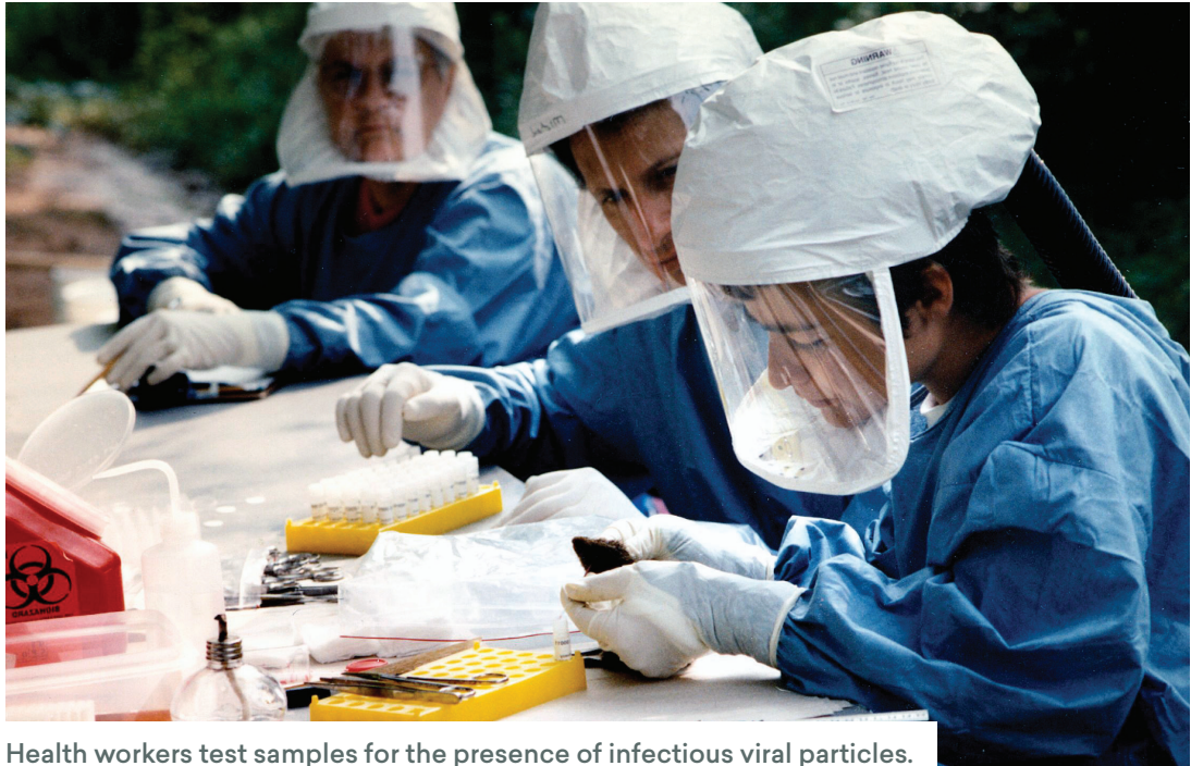
Health workers test samples for the presence of infectious viral particles.

(FACA) and Paperwork Reduction Act (PRA) can serve as barriers to efficient conduct of science during crisis at a federal level: the FACA can prevent rapid access to needed expertise and advice, and the PRA can slow the rapid collection of critical human subject data. In addition, the sometimes lengthy (weeks- or months-long) process of Institution Review Board (IRB) approval does not always align with the compressed timelines typical of rapidly unfolding crises.<sup>16</sup> Reform of these policies that provide limited exemptions for science during crisis, while protecting the public's "right to know" and preventing unnecessary intrusions of privacy, can improve the conduct of science during crisis. Because federal agencies have varying FACA guidelines and policies, pilot reforms in selected and critically important agencies (such as FEMA, NOAA, and others) can create realistic opportunities for progress.