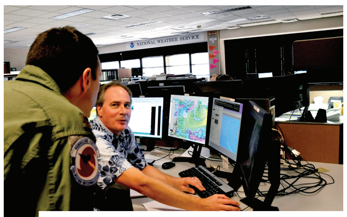
A forecaster at the National Oceanic and Atmospheric Administration Central Pacific Hurricane Center inputs weather data into a computer program to predict a hurricane's trajectory.

the scientific community to identify gaps that need immediate attention and to find scientific solutions to pressing problems. Further, the rapid dissemination of data collected during a crisis but prior to publication is often critical for decision-making and to avoid unnecessary duplication of effort. Publishers should adopt a policy of providing free, publicly available, fulltext access to journals, e-books, and databases with relevant information during and immediately following major crises. Recent advances within the biomedical community provide a potential model.